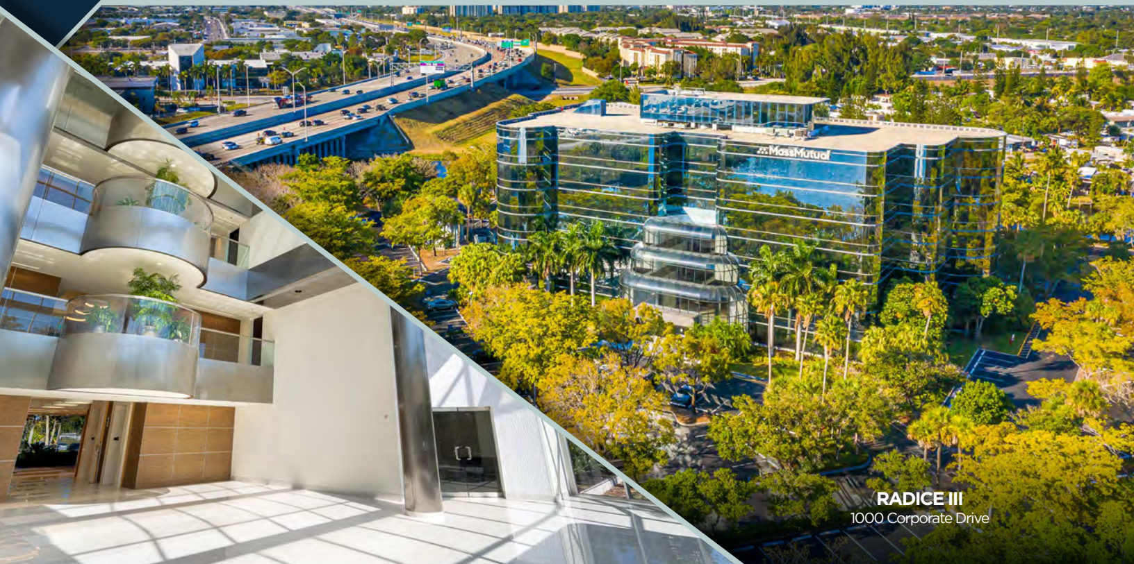
RADICE III 1000 Corporate Drive