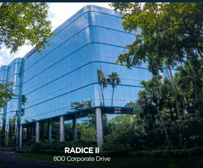
RADICE II 800 Corporate Drive