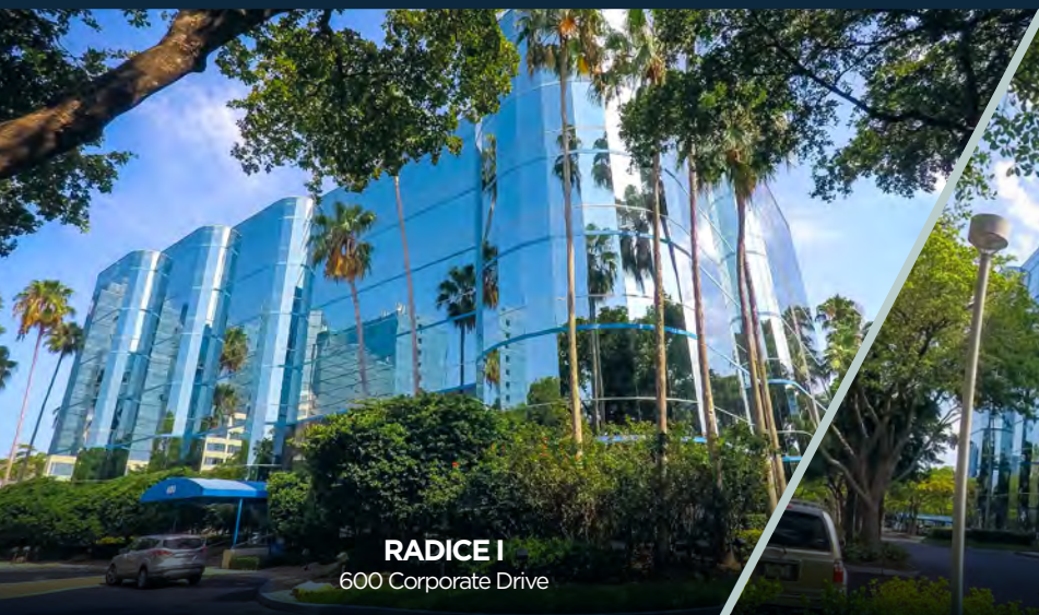
RADICE I 600 Corporate Drive